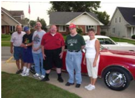
The Dutchmasters Antique Car Club included people from COC in one of their Cruisin' Nights this summer!