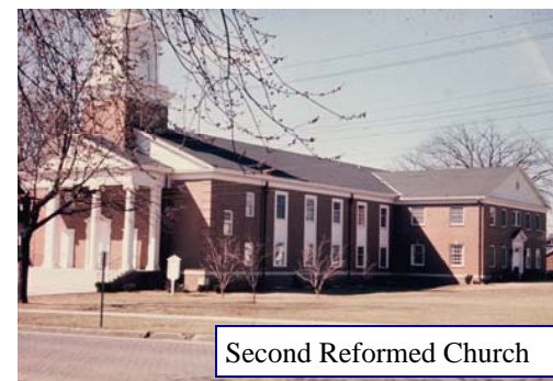
Second Reformed Church

It all began on September 15, 1969 with five children. The first classes met at Second Reformed Church.