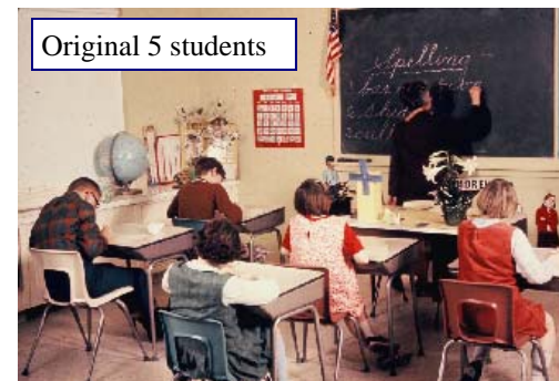
Original 5 students

It all began on September 15, 1969 with five children. The first classes met at Second Reformed Church.