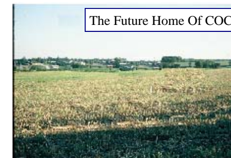
The Future Home Of COC

Early in C.O.C's history, land was purchased along Main Street and Big Rock Road. There was a time of construction and building which ended in 1975 at which time the building was dedicated.