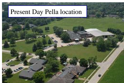
Present Day Pella location

COC has expanded in the South East region of Iowa through the years. We now offer services in Oskaloosa (1989) Des Moines (1990), and Indianola (1994).